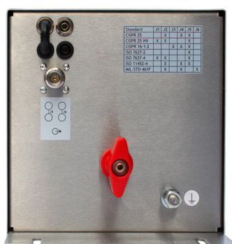
HV-AN 150, view to the EUT port