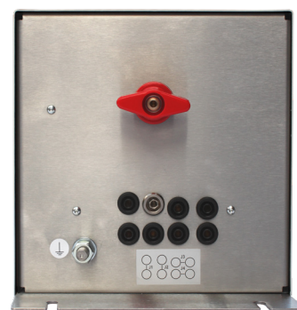
HV-AN 150, view to the AE port